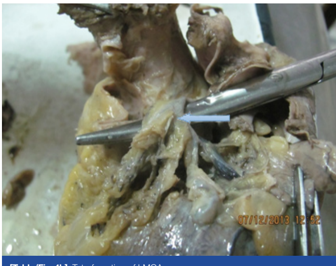
[Table/Fig-4b]: Tetrafurcation of LMCA

The location and level of the ostia are very important for the successful performance of a coronary angiogram during manipulation of the catheter tips. Difficulties may arise more considerably in patients in whom the ostium is above the level of sinotubular ridge (Taylor